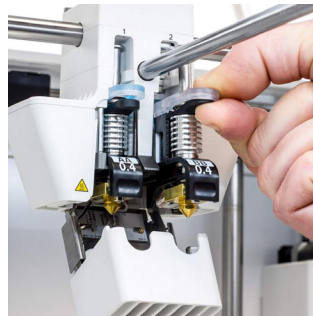
Print core BB Quick-swap nozzles for build and water-soluble support materials. Available in 0.25, 0.4, and 0.8 mm