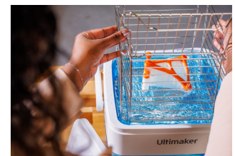
PVA Removal Station Remove water-soluble PVA support material up to 4X faster