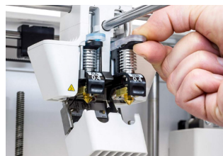
Print core BB Quick-swap nozzles for build and water-soluble support materials. Available in 0.25, 0.4, and 0.8 mm