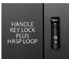
HANDLE KEY LOCK PLUS HASP LOOP