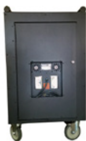
LOCKING REAR DOOR WITH CORD STORAGE