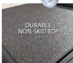
DURABLE NON-SKID TOP