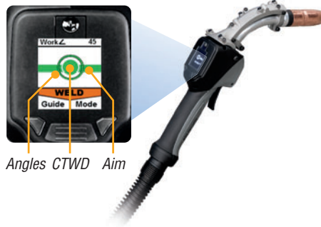
Angles CTWD Aim

ArcStation™ base features a 1/2-inch reversible steel table top and ships complete with drawers, gun holder, quick-release clamps and heavy-duty casters for mobility.