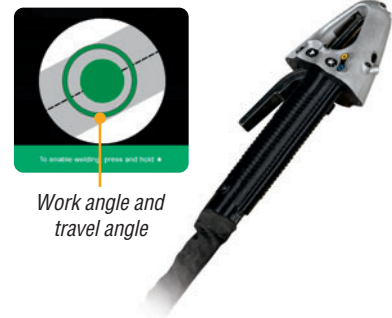
Work angle and travel angle

SmartGun is a glove-friendly, industry-exclusive 400-amp MIG gun featuring built-in LEDs that are tracked by the system's cameras. The ergonomic soft-grip handle provides tactile vibration feedback that helps guide real-time performance adjustments, reinforcing optimal position and movement. The OLED display on the SmartGun provides initial visual feedback to guide proper gun positioning. Pushbuttons provide a convenient alternative to the touchscreen for navigation.