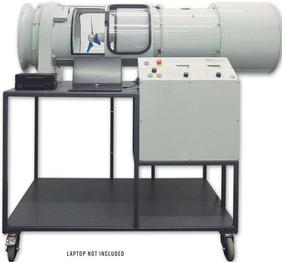
LAPTOP NOT INCLUDED

This is a versatile, compact apparatus for teaching the fundamentals of kinetic wind energy conversion into electrical power. Flexibility is at the core, it has a castor-mounted frame for mobility and functionality and allows students to 3D-print their own blades for advanced experimentation.