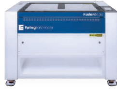
Fusion Edge 24