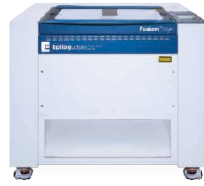
Fusion Edge 12 (Fiber)